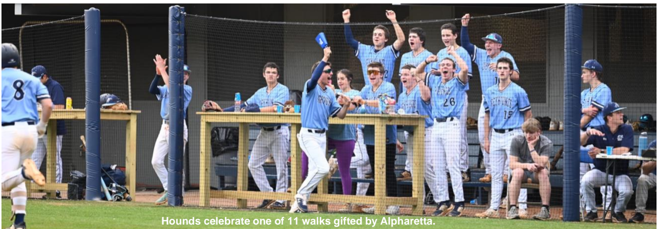
Hounds celebrate one of 11 walks gifted by Alpharetta.